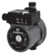
UPA BOOSTER 15-90