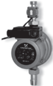
UPA BOOSTER 120