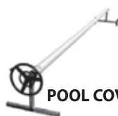
POOL COVER ROLLER