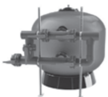
PVC MANIFOLDS For Commercial Filters

PVC Valve manifolds with 5 pieces of ball or butterfly valves complete mounted with manifolds having options for single or two filter system.