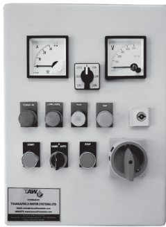
EDOL-PLAV & DELTA PAV