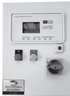
EDOL-SPLC & DELTA SPLC